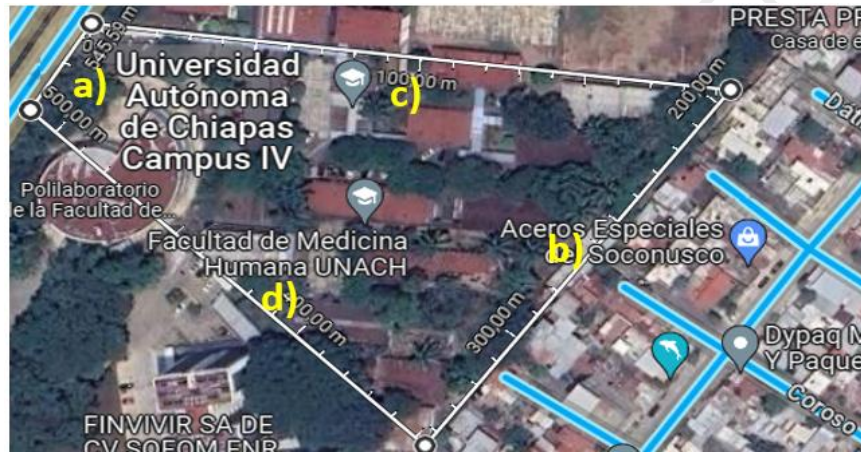
Figure 1. Map owned by Google Maps, Study area (yellow letters), and neighboring houses (blue box).

indica ), nance ( Byrsonima crassifolia ), guanabana ( Annona muricata ), almond ( Prunus dulcis ), and ornamental trees, such as palms ( Syagrus romanzoffiana ) and Indian laurel ( Ficus microcarpa ). The average temperature and relative humidity during the rainy and dry season were 24.3 ° C and 30 ° C, and 89% and 83.5%, respectively. During the rainy season, a total of 2,314 mm of precipitation was reported (conagua.gob.mx), (7).